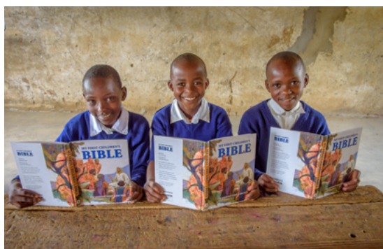
Three kids read children's Bibles that World Vision provided for a Christian education class at a school in Mwala, Kenya.