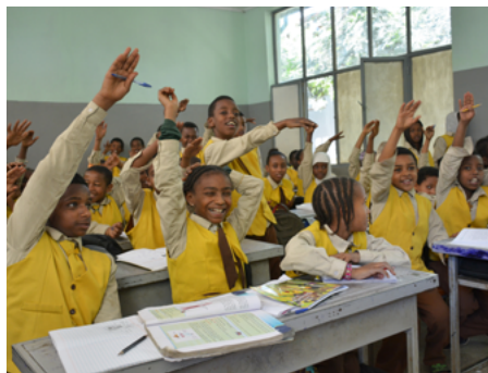
Schoolchildren in Addis Ababa, Ethiopia are eager to learn.

Twenty years later, there were now two schools, the second much larger and more modern. As we walked down the street, both the primary and the secondary schools were being dismissed. We suddenly became engulfed in a sea of hundreds of smiling, curious children and adolescents, all dressed in their colorful uniforms. I wanted to ask them about their life since the famine, but then I realized that none of them were even alive back then ... instead, these were the sons and daughters of those children we had helped! Those were the seeds of survival planted 20 years earlier, and the fruit was stunning.