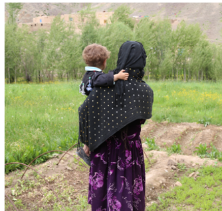
An Afghan mother holds her young child.

In Ethiopia, I had a similar experience when I returned two decades later to a feeding camp that I had visited when the country was beginning to recover from the devastating famine of 1984–85. Among the early rebuilding efforts we were making, a small school had been constructed for the children who had survived the famine.