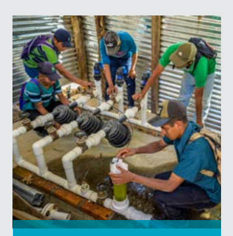
Solutions that last

Communities lead the installation of latrines and handwashing stations, as well as hygiene behavior-change efforts, to help eliminate open defecation and prevent the spread of deadly infectious diseases.