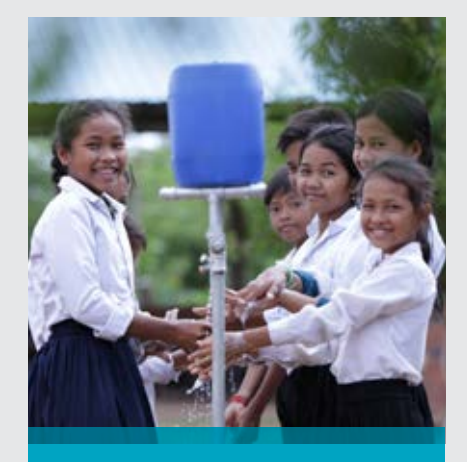
Sanitation and hygiene

World Vision ensures clean water access through right-sized equipment and use of appropriate water sources, manual drilling to reduce costs, and mechanized wells with solar pumps. In 2020, we installed nearly 100 community water points per day.