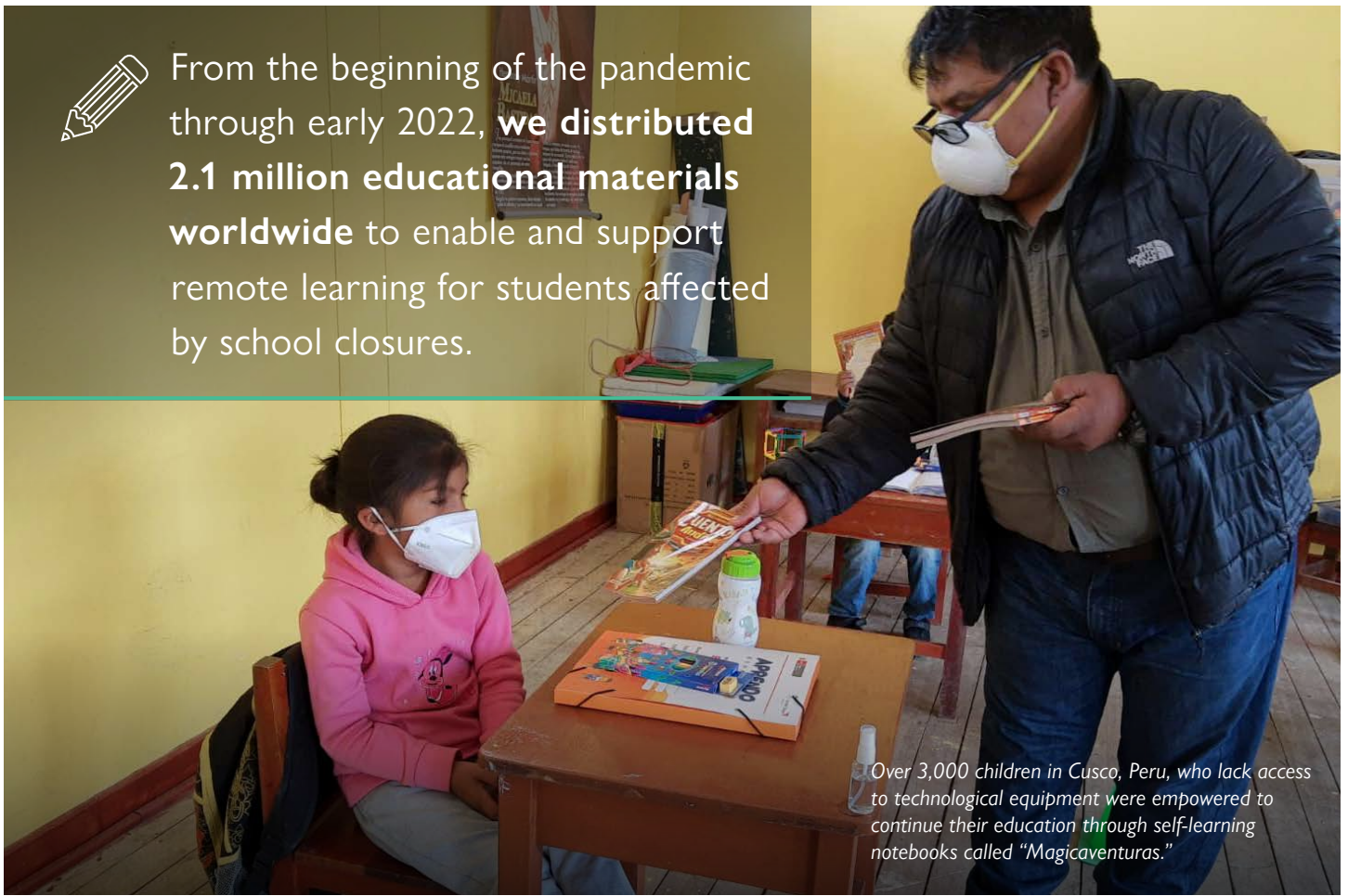
Over 3,000 children in Cusco, Peru, who lack access to technological equipment were empowered to continue their education through self-learning notebooks called “Magicaventuras.”

From the beginning of the pandemic through early 2022, we distributed 2.1 million educational materials worldwide to enable and support remote learning for students affected by school closures.