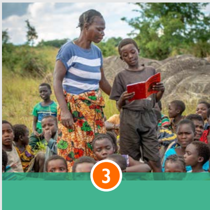
Establish afterschool reading camps with trained volunteers and age-appropriate books for children to take home, so they can get excited about reading