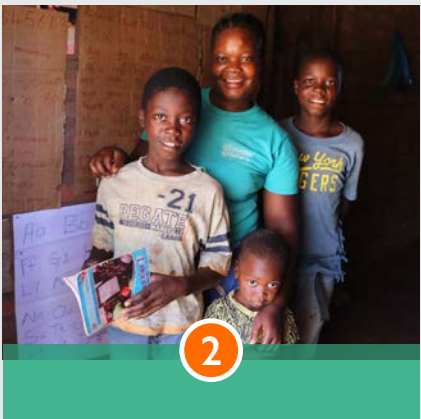
Empower parents to learn along with their children and understand the value of education, so they prioritize school