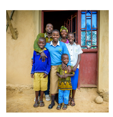
For families in Rwanda, clean water, sanitation, and hygiene can transform the lives of generations to come.

Due to abundant rainfall over most of the country, Rwanda possesses adequate water resources, primarily in the form of springs and groundwater. Drilled wells are less common in such hilly terrain, and nearly 90 percent of rural areas can be served by springs or rivers that are protected, and water piped via gravity or solarpowered pumps through the hills of Rwanda to communities.