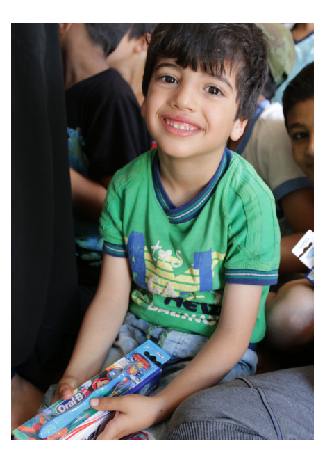
Across the world, water, sanitation, and hygiene (WASH) bring smiles to the faces of families, especially women and children.