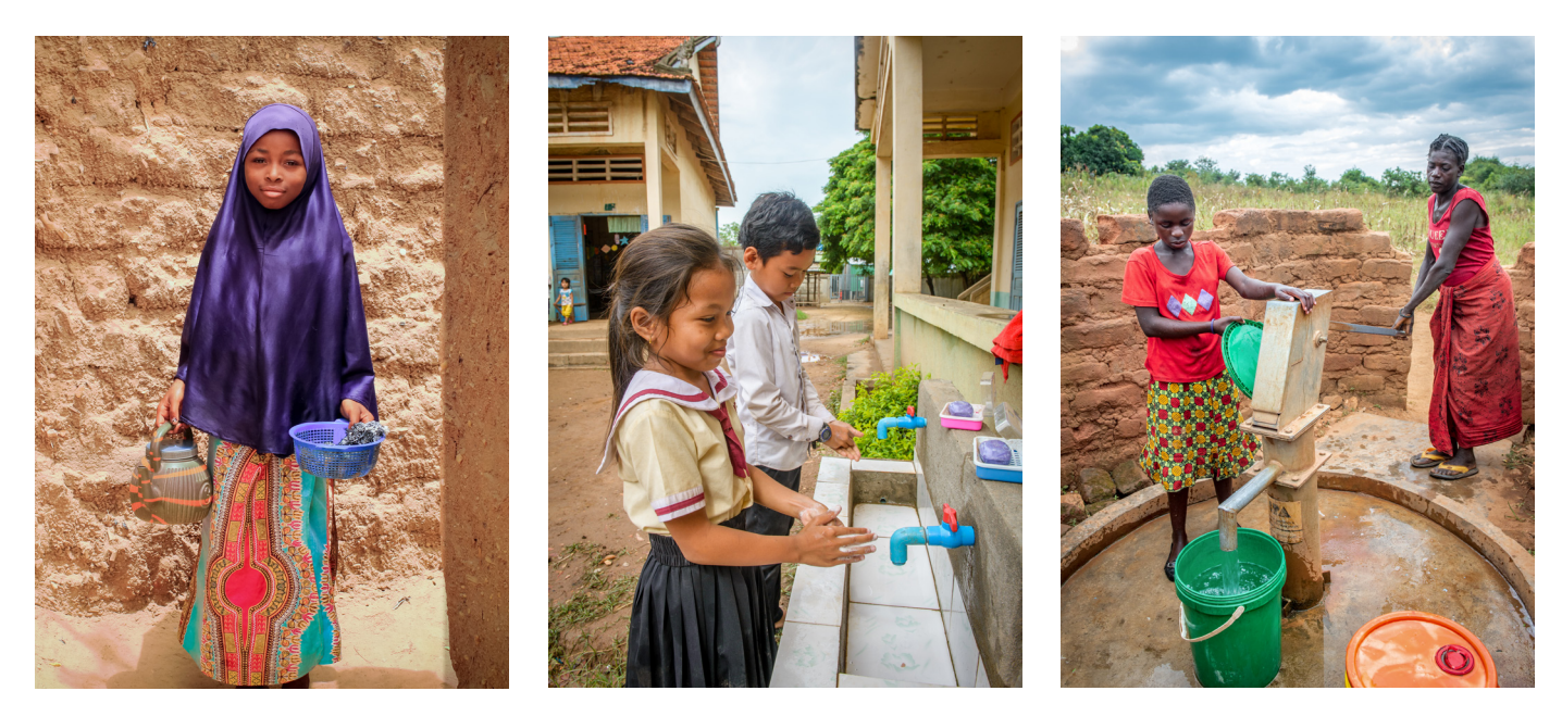
Water, sanitation, and hygiene (WASH) changes the trajectory of a child's future by supporting improved health and opportunity.