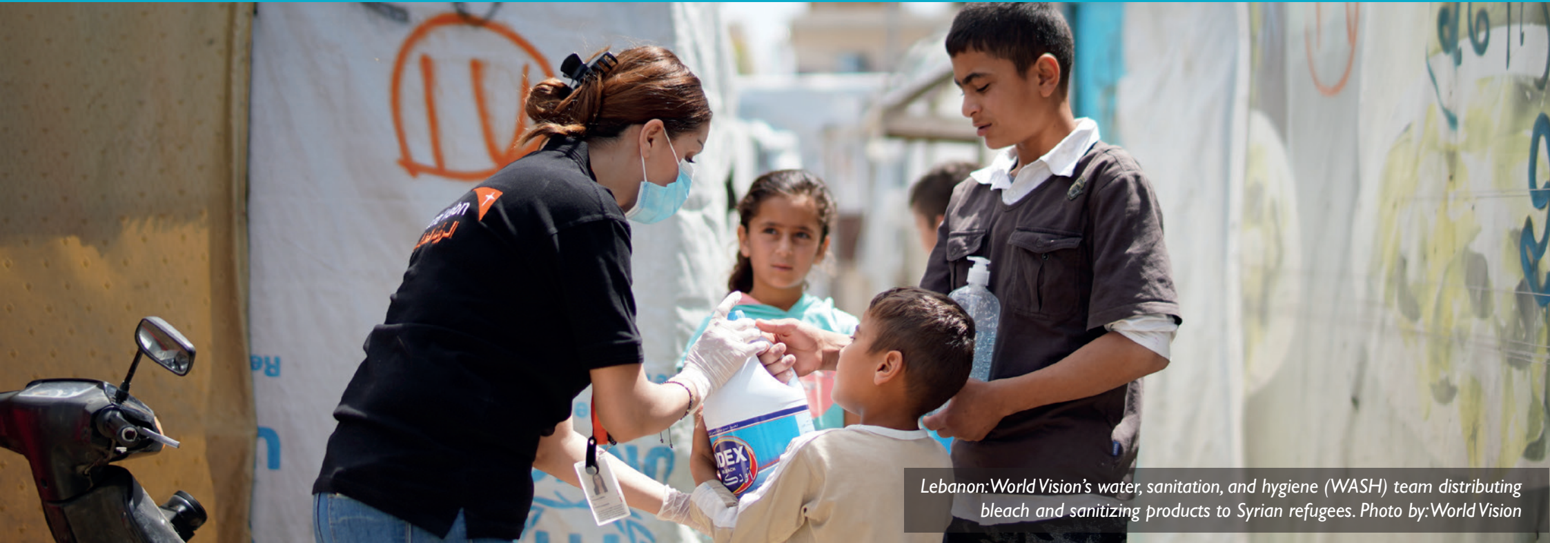
Lebanon: World Vision's water, sanitation, and hygiene (WASH) team distributing bleach and sanitizing products to Syrian refugees.

We would like to thank our generous donors, partners, and supporters including: