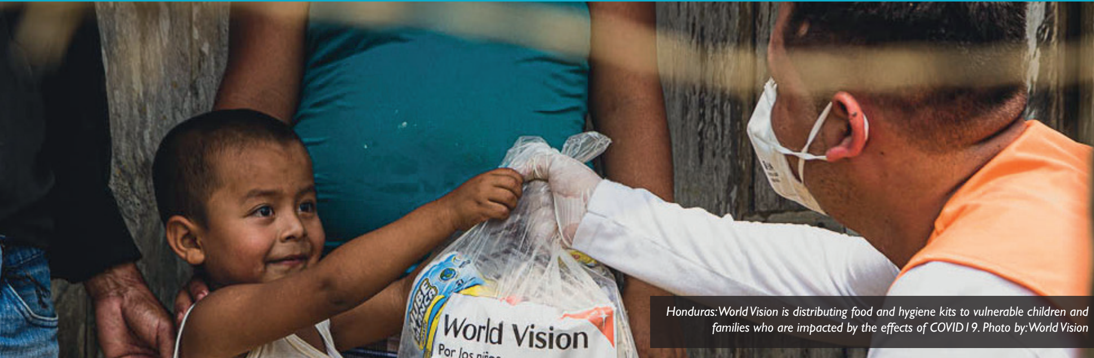
Honduras: World Vision is distributing food and hygiene kits to vulnerable children and families who are impacted by the effects of COVID 19.

We would like to thank our generous donors, partners, and supporters including: