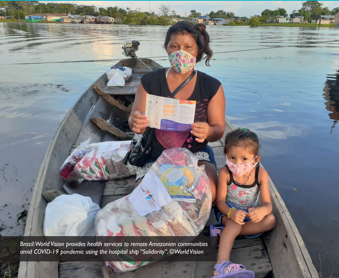
Brazil: World Vision provides health services to remote Amazonian communities amid COVID-19 pandemic using the hospital ship "Solidarity".

We would like to thank our generous donors, partners, and supporters including: