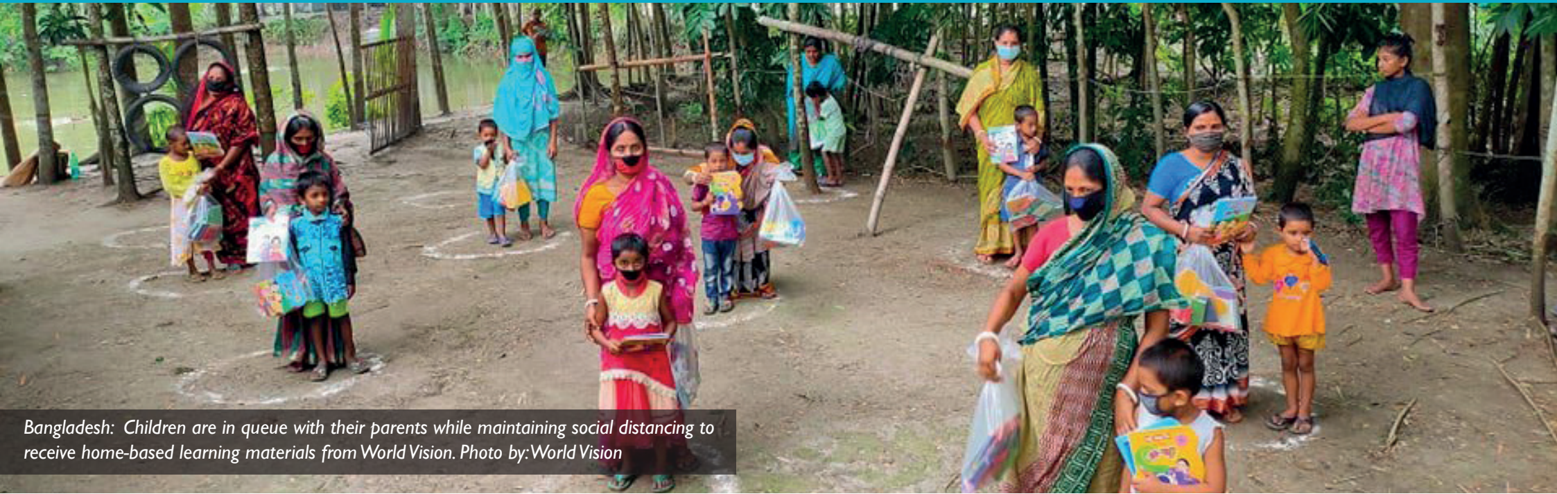
Bangladesh: Children are in queue with their parents while maintaining social distancing to receive home-based learning materials from World Vision.

We would like to thank our generous donors, partners, and supporters including: