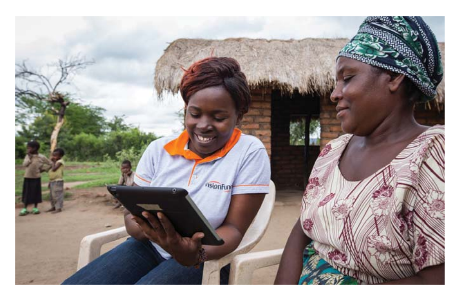
By improving technology, VisionFund is able to bring financial services to rural villages, meaning farmers do not have to make long, costly trips to branch locations.

Operations: VisionFund has determined "best of breed" operational standards across its MFI network. It has contracted with MicroFinance in Motion (MiM) to provide these services. The standards are client focused and enable each MFI to serve clients efficiently. They have been tested in VisionFund Zambia and VisionFund Mexico in an effort to mitigate risks before the