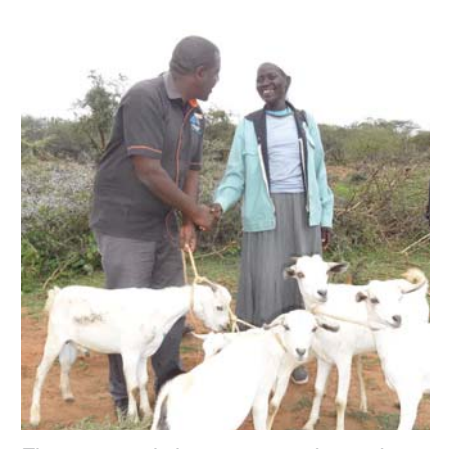
This project is helping women, who used to perform FGM/C procedures for a living, gain new skills and income opportunities.

In addition, the project formed a life skills club for boys and girls at each of the five schools. Nearly 850 young people are