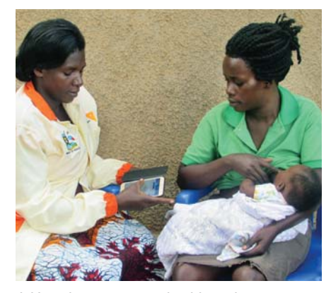
A Ugandan community health worker uses an app on her phone to provide timely health counseling messages to a new mother.

All this is working together to create a safer world for mothers, babies, and young children. A shining example of this is a recent random sampling of beneficiaries in Uganda that showed the percentage of women having their babies in a health facility increased from 55 percent to 71 percent, and families with access to safe water improved from