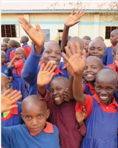
View a video from the Bible club at Kinze Primary School in Kalawa: https://vimeo.com/179234692

The Kenya Christian Discipleship Project has reached 54,422 people since the beginning of the pilot project in 2014, giving church leaders the skills to better minister to children and families in their congregations.