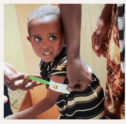
Your support is ensuring children are screenec and treated for malnutrition.

In FY18, 6,980 children received diagnosis and treatment in their village