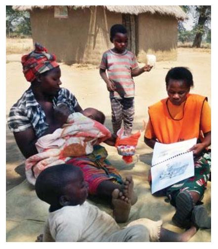
A community health worker in Zambia provides counseling to a mother on nutrition and maternal and child health issues.

More families are now able to reach the potential that God intends for them. They are living life in the fullness promised to us in John 10:10. May you be richly blessed for bringing this help and hope to families.