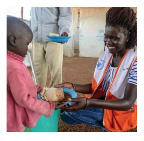
As families arrived at a displacement camp in the Democratic Republic of Congo, World Vision provided emergency food supplies, including hot meals and high-energy

Thank you for helping us serve children and their families in their greatest hour of need.