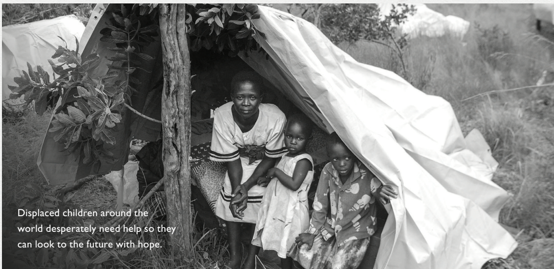
Displaced children around the world desperately need help so they can look to the future with hope.

When it comes to raising awareness about the living conditions of refugees around the globe, World Vision couldn't ask for a better ambassador than Patricia Heaton.