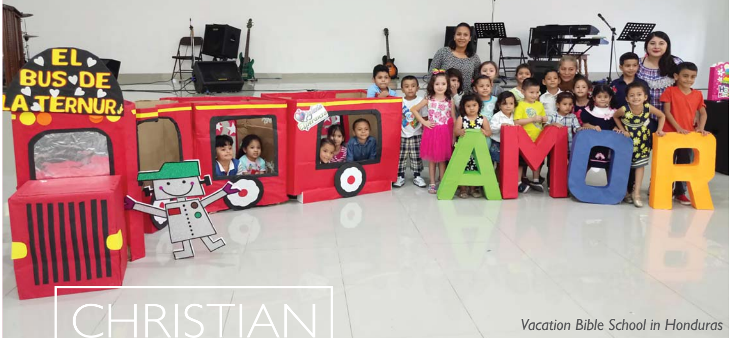
Vacation Bible School in Honduras