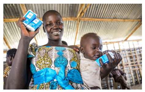
With highly fortified therapeutic food from World Vision, malnourished children are able to regain their energy.

World Vision screened children for malnutrition and followed up with treatment, if needed. We also taught parents about proper nutrition and hygiene, and increased access to clean water by installing new water sources, repairing pipelines and boreholes, and distributing water purification tablets. Over the last five years, 89 percent of the severely malnourished children we treated around the world have made a full recovery.