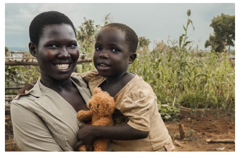
With the help of partners like you, World Vision continues to help meet the greatest needs of children across East Africa, giving little girls like this one hope for a brighter future.

Despite these achievements, this region continues to grapple with ongoing conflict, natural disasters, and the continual arrival of refugees in displacement camps. Thank you for enabling us to care for millions of people in East Africa during their time of greatest need.