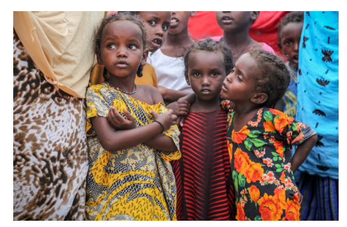
As of December 2018, 2.7 million children in Somalia were in need of humanitarian assistance.

for rain. At least 294,000 children under 5 are at risk of malnutrition, making the distribution of highly fortified therapeutic food to these children one of World Vision's priorities.