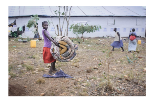
To care for children who fled South Sudan and are now living in refugee settlements in Uganda, World Vision provides safe places to learn and play.

A World Vision survey conducted in September 2018 revealed that more than half of all children in refugee settlements are at risk of malnutrition.